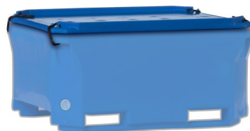
Cover with rubber straps maintaining firmly the cover in place