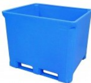
For specific needs, the pallet box can be molded without drain