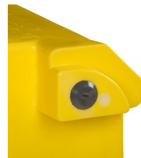
Resistant foot pad protecting the base

Tel: (450) 471-2772 • Fax: (450) 951-8700