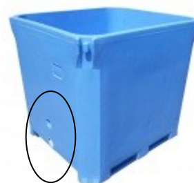
The drain cap screwed directly to the bin to avoid losing it