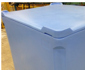
PE875 The only model with a standard cover without strap