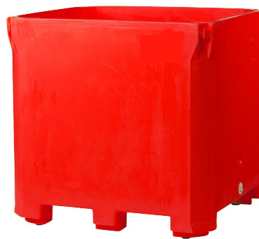
9-leg base for 4-way entry with forklift or handtruck