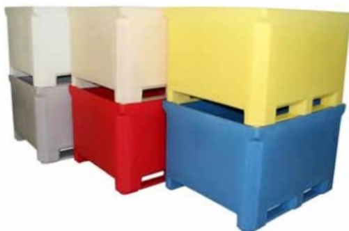
Many colors are available to delimit working areas in industrial and food-processing industries

Very robust and durable pallet boxes offering a guaranteed return on investment!